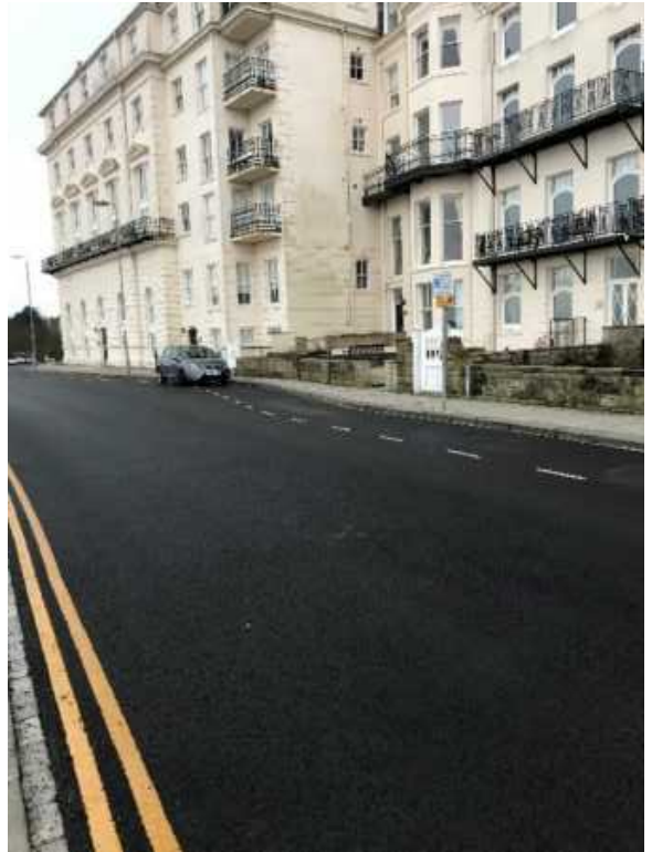
Newly laid tarmac on The Esplanade.