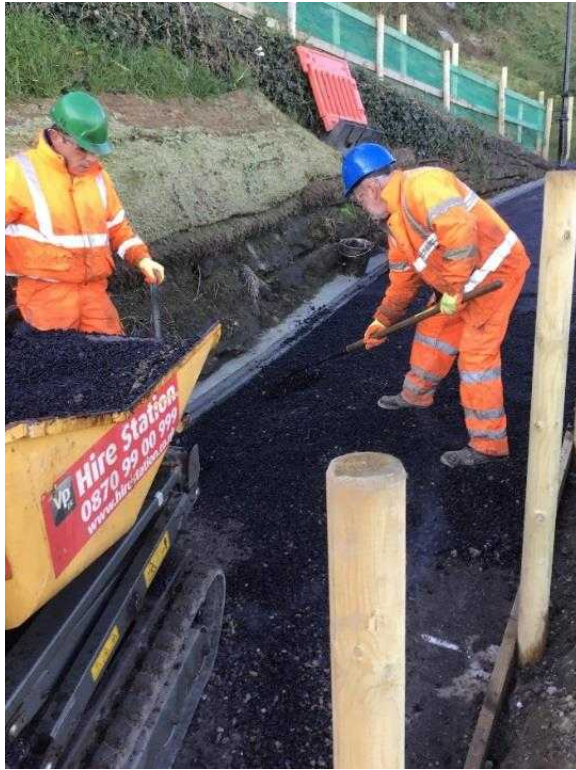
Footpath surfacing works.