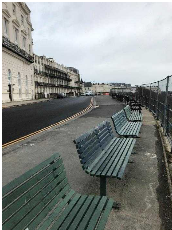
Re-fitted benches on The Esplanade.